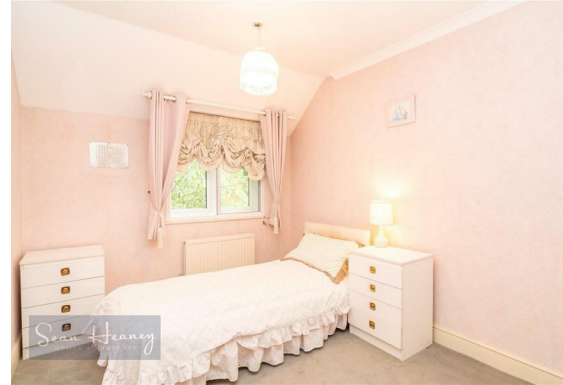
Bedroom 2 12'5 x 8'9 (3.78m x 2.67m)